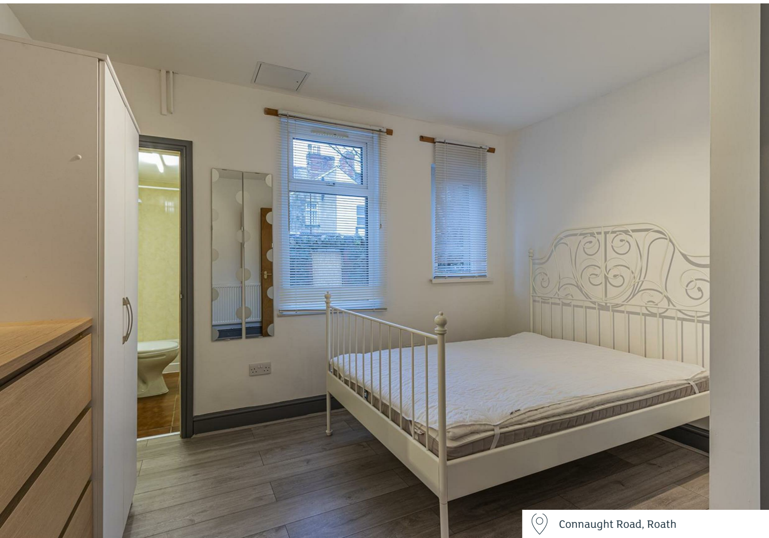
Connaught Road, Roath